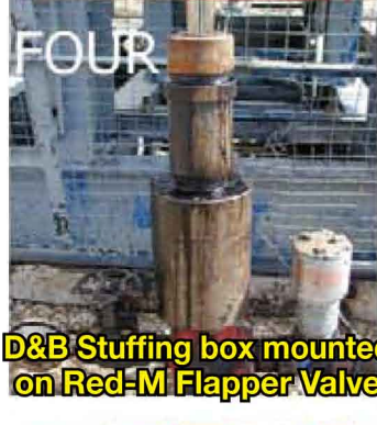
D&B Stuffing box mounted on Red-M Flapper Valve