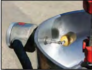
Fluid level Div1 ESD switch.