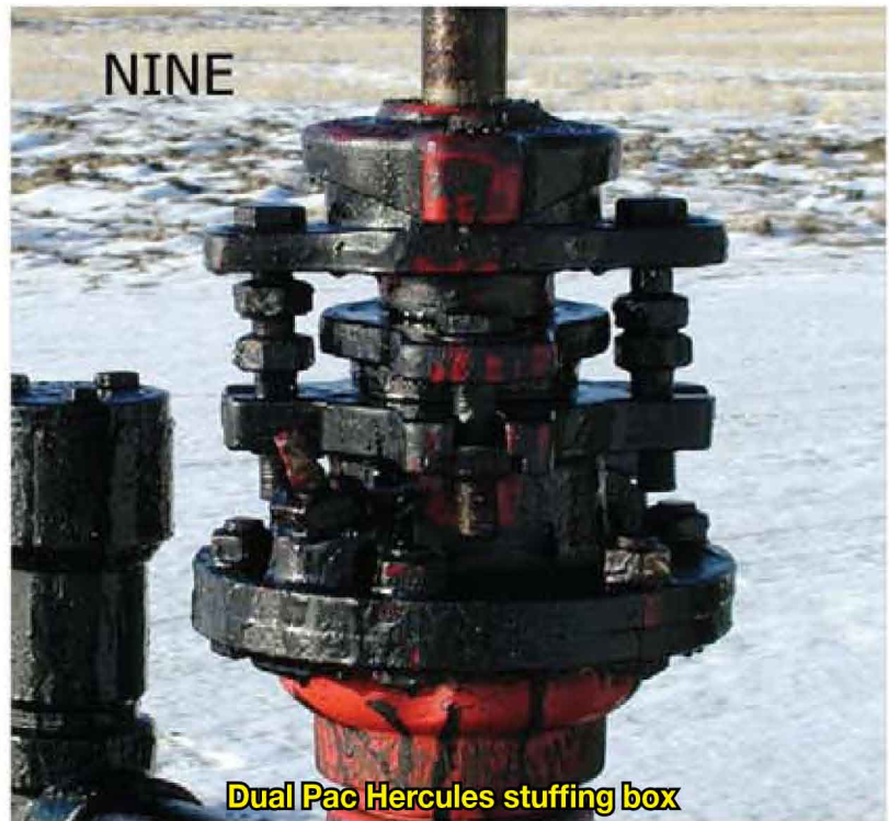
Dual Pac Hercules stuffing box