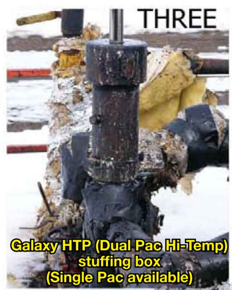
Galaxy HTP (Dual Pac Hi-Temp) stuffing box (Single Pac available)