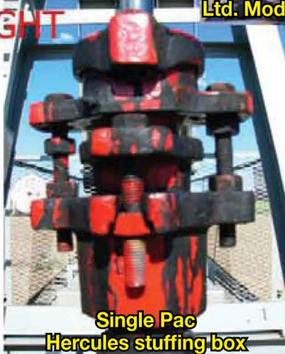
Single Pac Hercules stuffing box