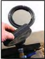
4" manway for vacuum truck.