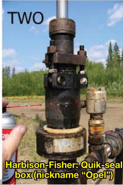
Harbison-Fisher: Quik-seal box (nickname "Opel")