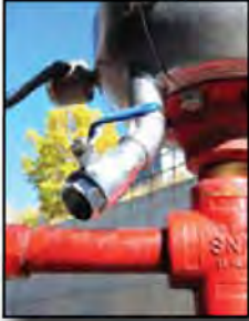
Easy to drain ball valve.

2 models available to accommodate lubricating boxes STANDARD FEATURES