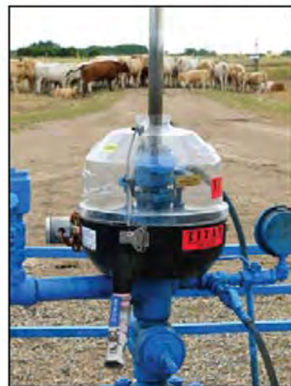
Protected soil and ground water

NOTE: Unit installed in minutes without tools, clear top removed in seconds.