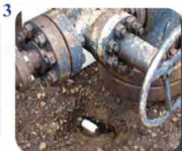
3 Wellhead is clean but the underground soil remains contaminated.