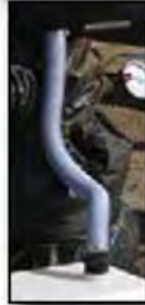
All weather flex hose.