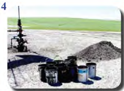
4 Only surface soil is removed and replaced. Deeper contaminated layers are left behind.