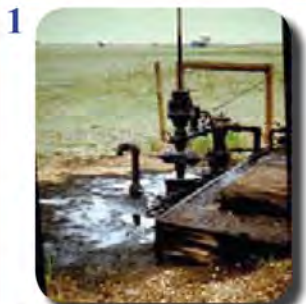
1 Operator replaces the rod seals after a leak has occurred.