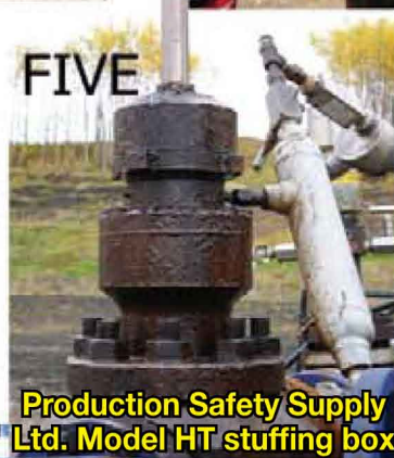
Production Safety Supply Ltd. Model HT stuffing box