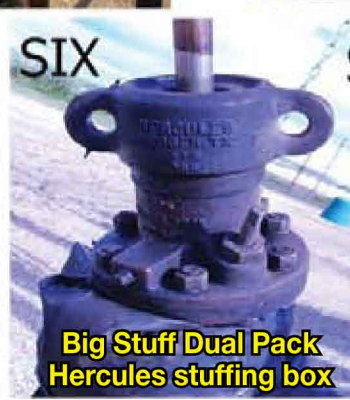
Big Stuff Dual Pack Hercules stuffing box