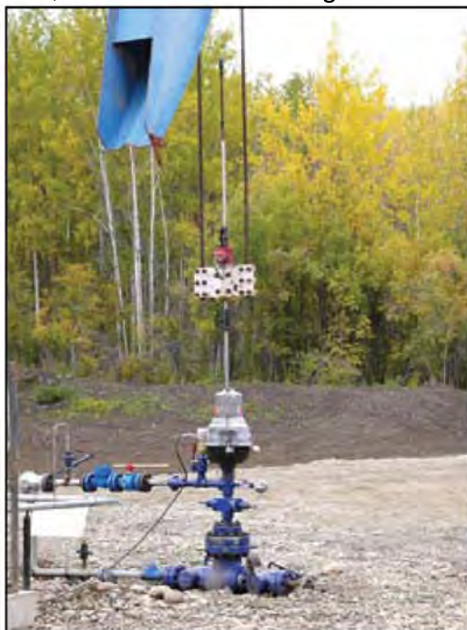
TOTAL OIL LEASE PROTECTION