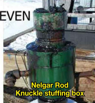
Nelgar Rod Knuckle stuffing box