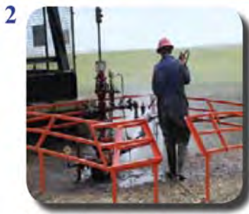
2 Steam cleaner washes oil from the wellhead deep into the soil.