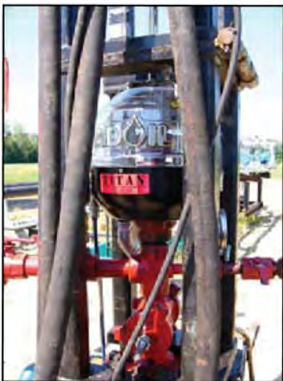
Hydraulic pumpjack C.B.M. gas well

All TITANs are made of solid cast aluminum w/ S.S. fittings, are powder-coated, corrosion free & designed to last for decades.