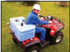
Quad tanks also available for remote LSDs.