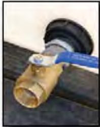
Easy to drain ball valve.