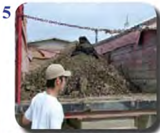
5 Surface soil must be disposed at a recognized site.

Wellsite clean-up repeated 6-12 months later and costs between $3000-$6000