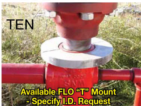
Available FLO "T" Mount - Specify I.D. Request

Note: Ease of service, adjustable, and flange 'BOP' has made the above DPSB Stuffing Box the most popular worldwide.