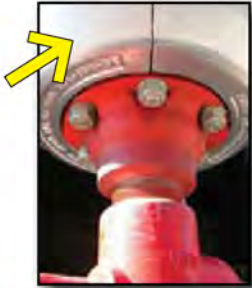
Snug fit around standard stuffing boxes.